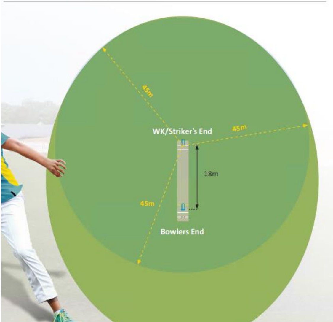
Pitch set up

Stumps Portable at bowlers end – option to bring both ends in to front crease line using 2 sets of portable stumps.